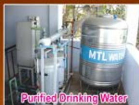
Purified Drinking Water